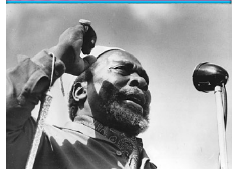
Jomo Kenyatta 1891–1978

A man willing to spend years in jail for his beliefs, Kenyatta viewed independence as the only option for Africans.